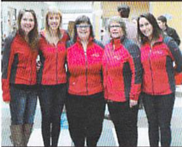
Meet the DiscoverAbilities Events Society Board of Directors

Join our Community Outreach Team and help us make great things happen!